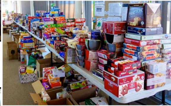
Right: donated food