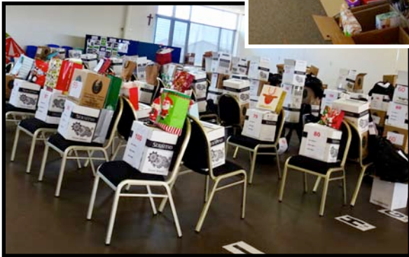
Left: completed hampers